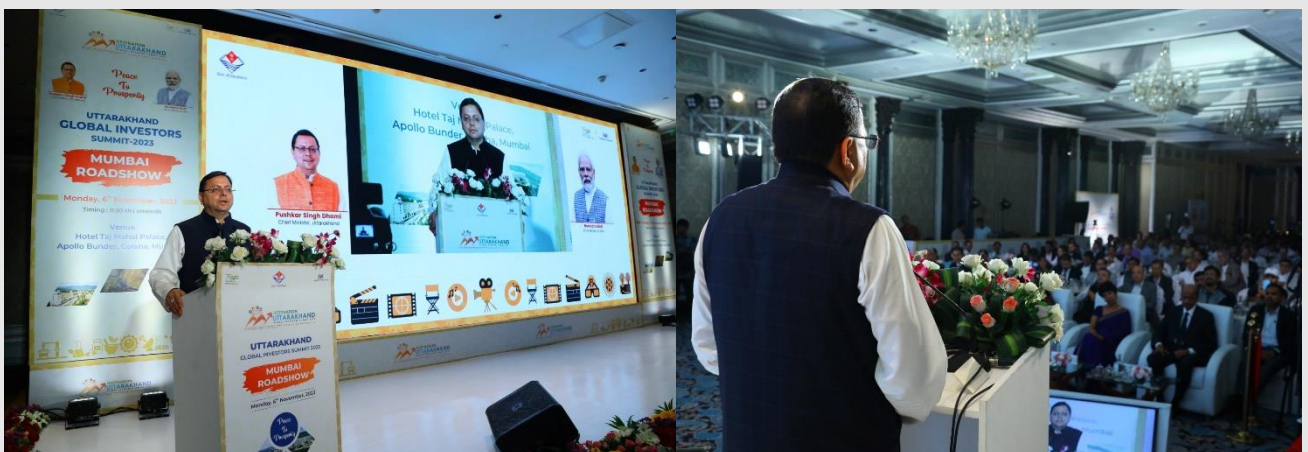
The roadshow at Taj Mahal Palace, Colaba in Mumbai