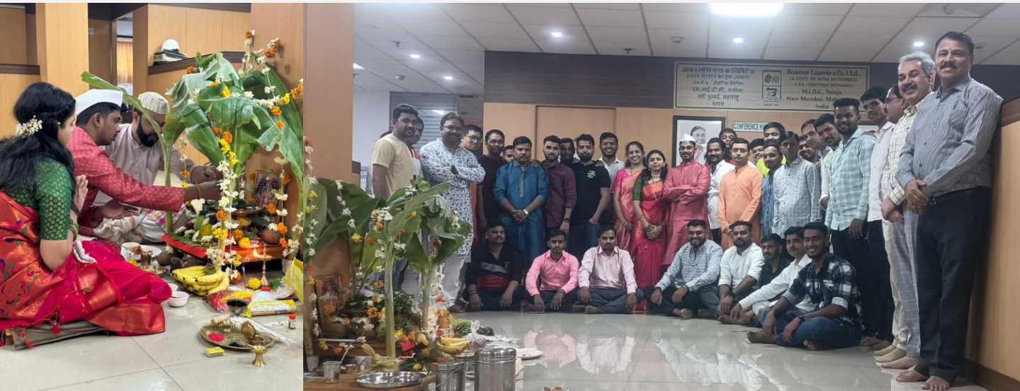
As part of employee engagement initiatives, Diwali puja was organised on 11 th November 2023 in the Industrial Packaging plant at Taloja, Navi Mumbai.