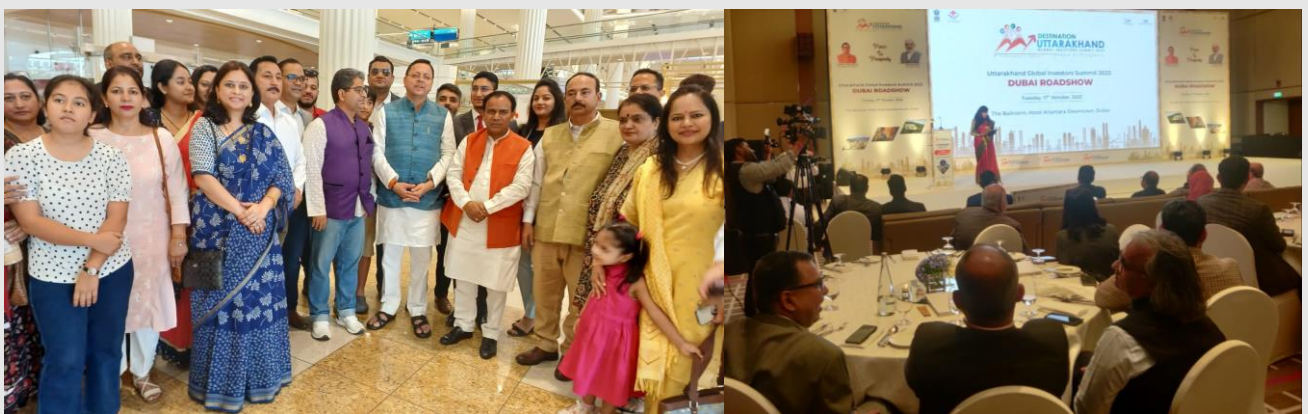
The roadshow of the Uttarakhand Global Investors Summit at Dubai

Vacations – Delhi organized the curtain raiser event of Uttarakhand Global Investors Summit 2023 and similar events in London and pan India in September, October and early November 2023 for the Directorate of Industries, Uttarakhand Government. As part of the series of the events a roadshow was organised in Dubai on 17 th October 2023 and in Mumbai at Taj Mahal Palace, Colaba on 06 th November 2023.