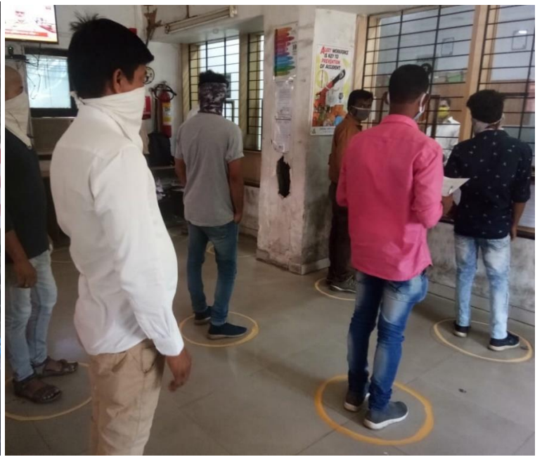
Social Distancing maintained at our Container Freight Stations