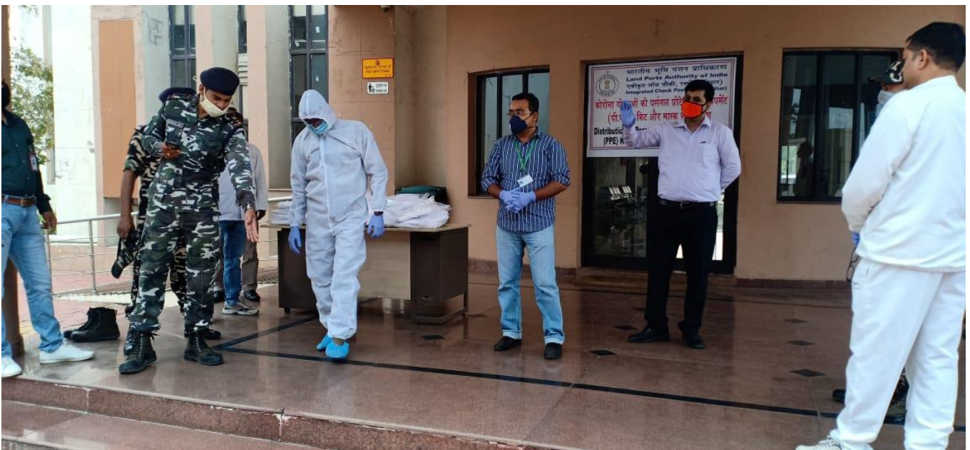
Distribution of PPE to employees at ICP Raxaul

Such unprecedented situations call for tough decisions and the nation under the guidance of Hon'ble Prime Minister, Shri Narendra Modi has embraced many measures and lockdown has been announced across the country. There is a coordinated effort across all sections of the society to control and contain this pandemic. We, at Balmer Lawrie too, are taking all steps to combat this challenge. Safety of all and business continuity are the topmost priorities at this juncture. Most of the employees are working from home, however, a lot of the frontline employees in offices / plants / CFSs / TCWs / ICPs, who under difficult circumstances, are working on emergency services during this lockdown period to help the Company cope with the situation. Adequate measures are being taken to maintain safety for all.