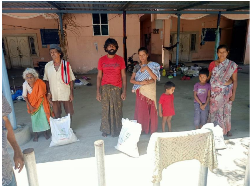
Distribution of food items to migrant and under privileged families by IP Chittoor under CSR activities during COVID-19 lockdown