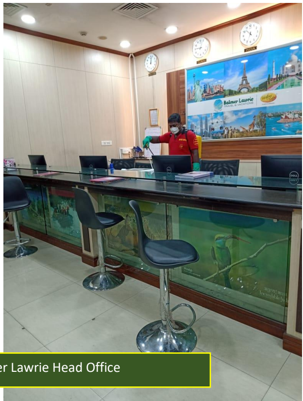
Sanitization at Balmer Lawrie Head Office